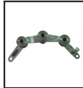
KWIKMOUNT RUNNING GROUND